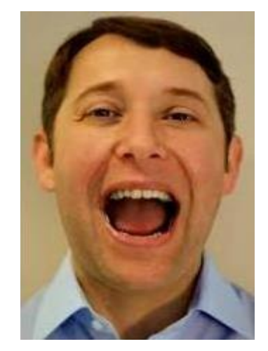
Fig. 1 Full Frontal Face Image